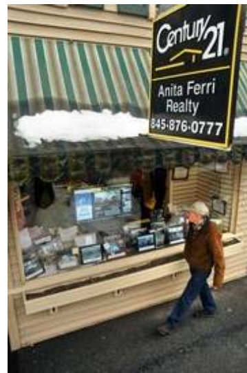
A monitor advertises real estate listings in the storefront window of Century 21 Anita Ferri Realty in Rhinebeck. The Village of Rhinebeck has ordered the owner to remove a monitor from this storefront window. It advertises real estate listings and local businesses.